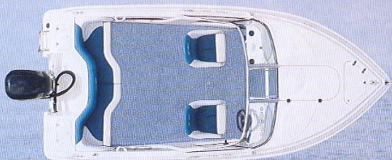
Standard deluxe bucket seats, complete with optional rear lounge, carpet and s/s boarding ladder.