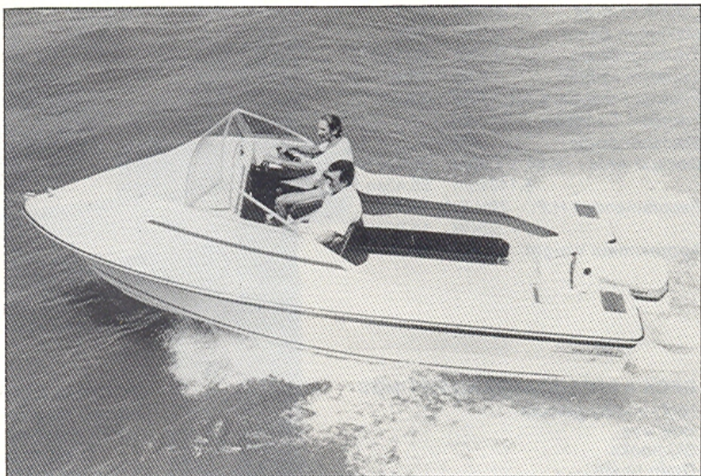
A Nichols Bros. Boat. Craftsmanship since 1946.